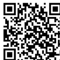
Half Up Half Down Hair